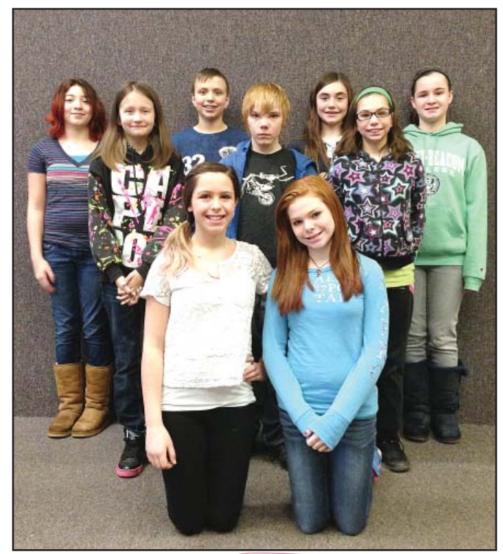
Junior High Chorus