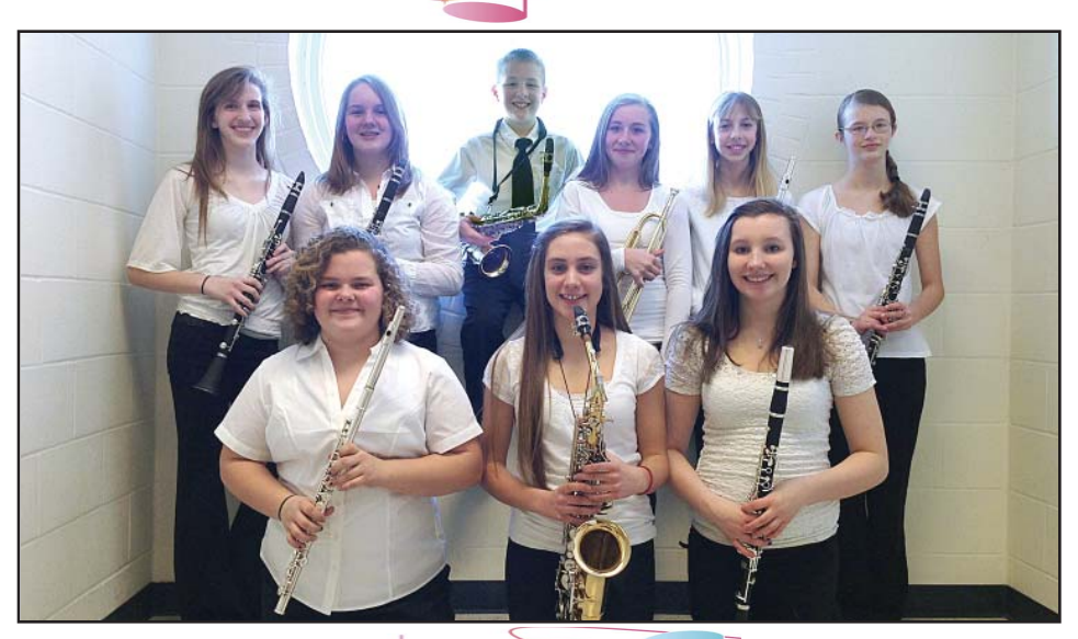
Junior High Band