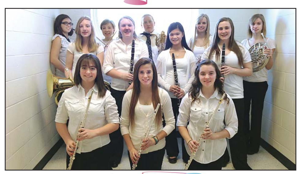
Senior High Band